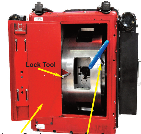
Access Door for resetting dimensions